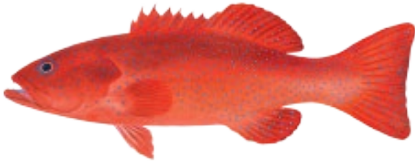
NAME: Leopard Coral grouper, Red Salmon Cod SCIENTIFIC NAME: Plectropomus leopardus FIJIAN NAME: Donu, Drodroua