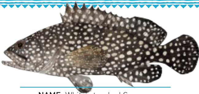
NAME: White-streaked Grouper SCIENTIFIC NAME: Epinephelus ongus FIJIAN NAME: Sinusinu, Kawakawasevula