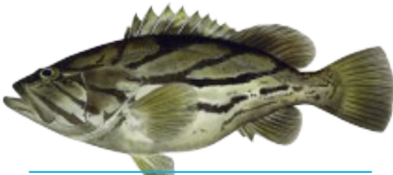
NAME: Comet Grouper SCIENTIFIC NAME: Epinephelus morrhua FIJIAN NAME: Kulinidovu, Votoqaninubu