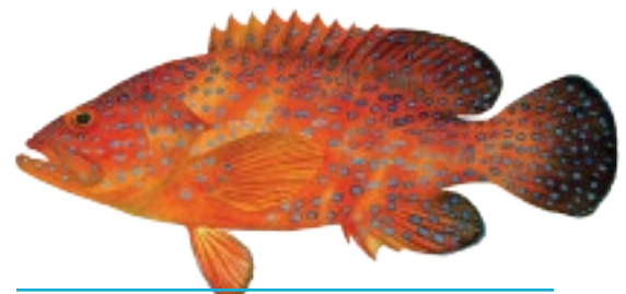
NAME: Coral Hind SCIENTIFIC NAME: Cephalopholis miniate FIJIAN NAME: Kialo ni Cakau, Kasala selagi