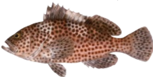
NAME: Highfin Grouper SCIENTIFIC NAME: Epinephelus maculatus FIJIAN NAME: Kasala - Votose