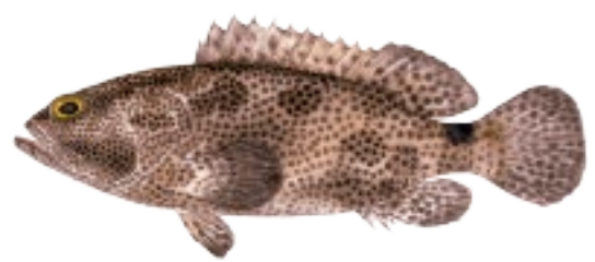
NAME: Camouflage Grouper SCIENTIFIC NAME: Epinephelus polyphekadion FIJIAN NAME: Kasala, Kawakawa, Kerakera