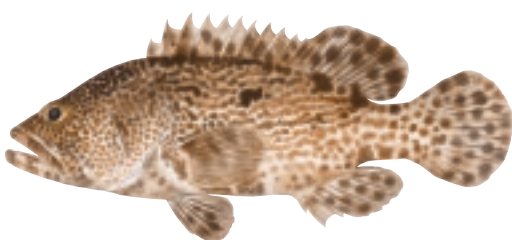
NAME: Brown Marbled Grouper SCIENTIFIC NAME: Epinephelus fuscoguttatus FIJIAN NAME: Cevanibua, Delabulewa

There is a ban on all species of fish that fall under kawakawa (grouper) and donu (coral trout). The fishing, sale and export (and associated activities such as transport) of all species are seasonally banned. The banned fish include but not limited to the following: