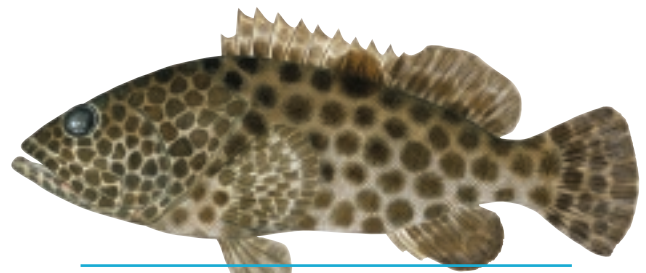
NAME: Greasy Grouper SCIENTIFIC NAME: Epinephelus tauvina FIJIAN NAME: Kawakawa vuilase