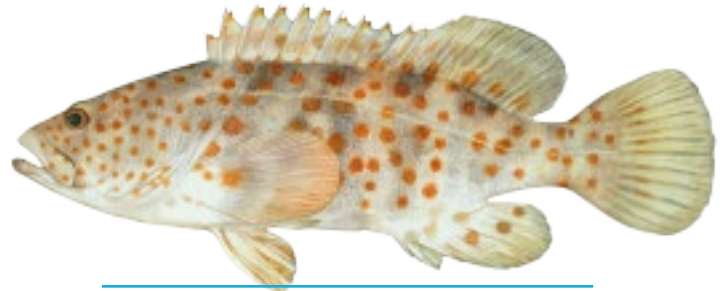
NAME: Green Orange Spotted Grouper SCIENTIFIC NAME: Epinephelus coioides FIJIAN NAME: Soisoi, Kasala seilagi