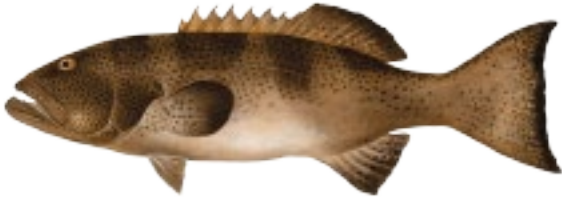
NAME: Blacksaddle Coral Grouper SCIENTIFIC NAME: Plectropomus laevis FIJIAN NAME: Donuloa, Lava