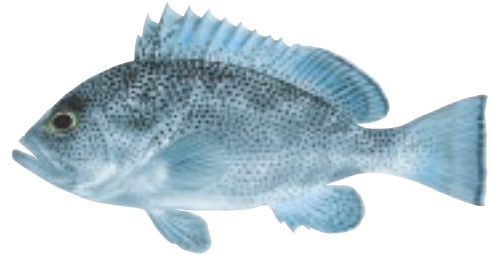
NAME: Blue Rock Cod SCIENTIFIC NAME: Epinephelus cyanopodus FIJIAN NAME: Revua, Rogoceva