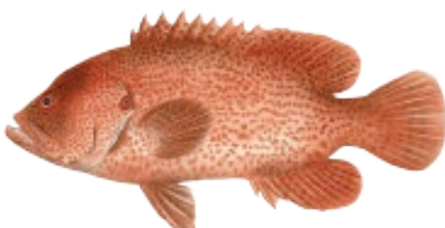
NAME: Tomato Hind SCIENTIFIC NAME: Cephalopholis sonnerati FIJIAN NAME: Kialo Sedamu