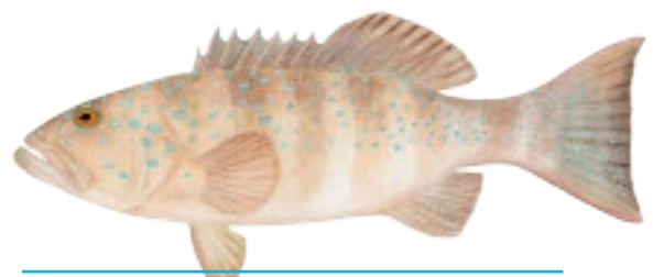
NAME: Spotted Coralgrouper SCIENTIFIC NAME: Plectropomus maculatus FIJIAN NAME: Donu, Donumatanisiga