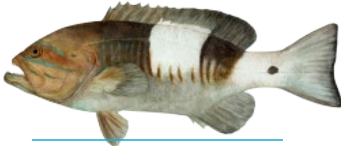
NAME: Masked Grouper SCIENTIFIC NAME: Gracila albomarginata FIJIAN NAME: Varavara, Varavaranitoga, Varavaranicakaulala