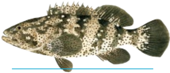
NAME: Malabar Grouper SCIENTIFIC NAME: Epinephelus malabaricus FIJIAN NAME: Soisoi, Votosiga