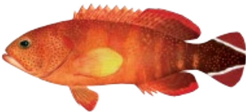
NAME: Darkfin Hind SCIENTIFIC NAME: Cephalopholis urodeta FIJIAN NAME: Kawakawadamu