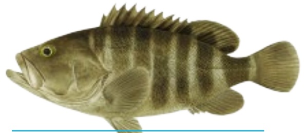
NAME: Eightbar Grouper SCIENTIFIC NAME: Epinephelus octofasciatus FIJIAN NAME: Kawakawaninubu, Balobi