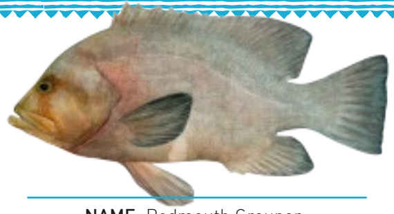
NAME: Redmouth Grouper SCIENTIFIC NAME: Aethaloperca rogae FIJIAN NAME: Kawakawaloa, Kasalaninubu, Kasalatuiloa