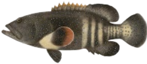
NAME: Peacock Hind SCIENTIFIC NAME: Cephalopholis argus FIJIAN NAME: Tikilo, Kialo, Kawakawaloa