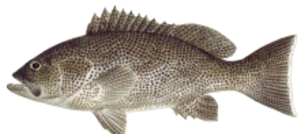
NAME: Brownspotted Grouper SCIENTIFIC NAME: Epinephelus chlorostigma FIJIAN NAME: Cevanibua, Cevaninubu