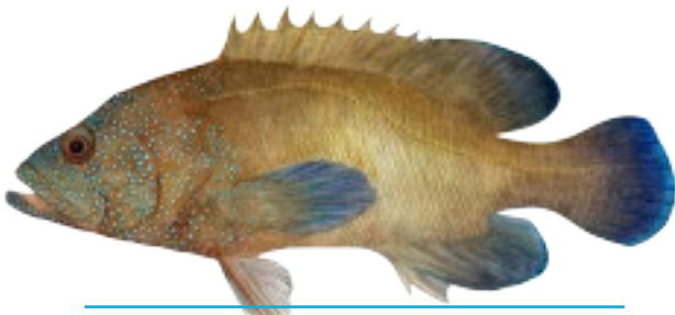
NAME: Blue-finned Rock Cod, Freckled Hind SCIENTIFIC NAME: Cephalopholis microprion FIJIAN NAME: Kawakawa, Revua, Kawakawairilagi