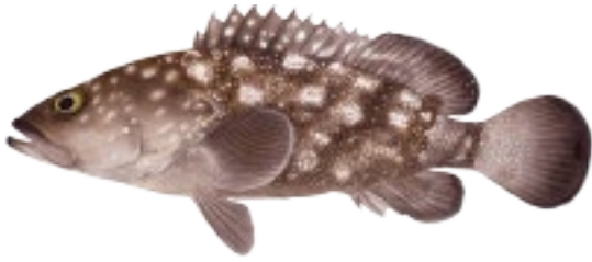
NAME: Whitespotted Grouper SCIENTIFIC NAME: Epinephelus coeruleopunctatus FIJIAN NAME: Kawakawanitiri