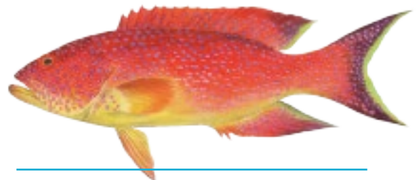
NAME: Yellowedged Lyretail SCIENTIFIC NAME: Variola louti FIJIAN NAME: Varavaranitoga