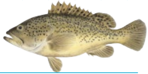
NAME: Speckled Grouper SCIENTIFIC NAME: Epinephelus magniscuttis FIJIAN NAME: Kulinimasi, Kasalaninubu