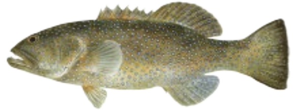
NAME: Squaretail Grouper SCIENTIFIC NAME: Plectropomus areolatus FIJIAN NAME: Donu, Bataisai