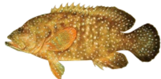
NAME: Bluespotted Hind, Bluespotted Grouper SCIENTIFIC NAME: Cephalopholis cyanostigma FIJIAN NAME: Kawakawa, Kialo Seavula