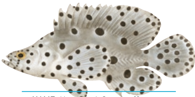
NAME: Humpback Snapper/Grouper SCIENTIFIC NAME: Cromileptus altivelis FIJIAN NAME: Kawakawa iriloa, Kawakawa dakurodu, Kialo takuse

You can also help by photographing any kawakawa and donu on sale and sharing it on the campaign Facebook page ( www.facebook.com/4fjmovement ). Please note the location, seller if possible, and time of day to help document the incident for the Ministry of Fisheries.